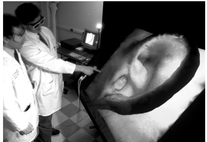
Figure 2 – ImmersaDesk

http://www.sbhis.uic.edu/VRML/Research/TemporalBone/researchTB.htm