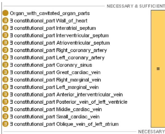
Fig. 4. The defined class Heart.

Third, the values of own slots of classes are converted either into existential restrictions on class properties or into values of