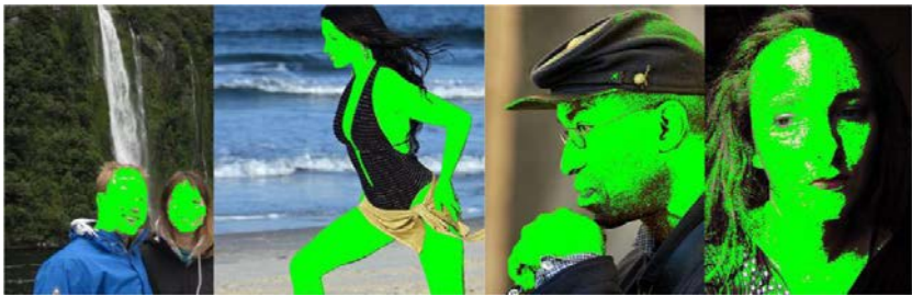
Figure 1: skin mapping using ANN - green pixels denote skin above the threshold

For example, a virtual character can learn the specifics of a real human face and body motion and attempt to mimic them in virtual character representation by slightly altering its underlying model, hence enhancing the virtual reality user experience. At the same time, in some of the augmented reality (AR) scenarios, virtual objects and characters can be inserted into the real-world video streams and allowed to interact with some real objects in real time, building-up on the VC physical world experience, and ultimately enhancing the AR user experience.