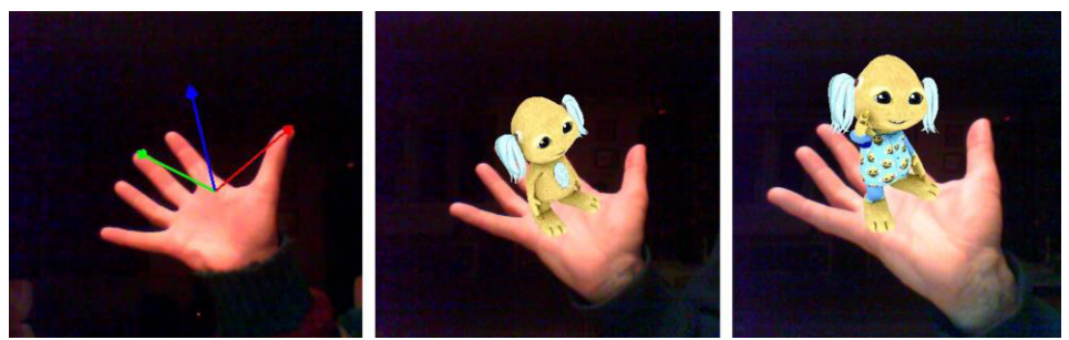
Figure 3: hand tracking and interaction with virtual characters in augmented reality settings

A human-centric cognitive architecture for a vision-capable virtual character may need to deal with various manifestations of the human appearance accessible non-intrusively by the vision sensors. The most expressive ones (aside from faces) could be human hands and the whole human body. All three categories call for efficient means of representing and handling non-rigid 3D shapes.