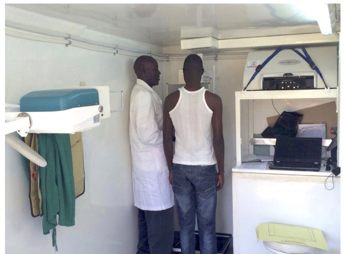
Figure 2. Radiographer preparing a patient for x-ray imaging of the lungs.

presents the decision in a simplified format to regional medical officers, who may have little or no background in radiology.