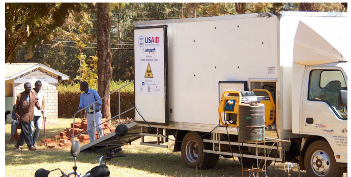
Figure 1. An HIV-positive patient being led to the truck-mounted x-ray unit for tuberculosis (TB) screening.

We have conducted population screening in western Kenya in collaboration with Academic Model Providing Access To Healthcare (AMPATH), an NGO that provides treatment to some 200,000 HIV-positive patients. For TB infection screening, we provide lightweight digital x-ray units that are mounted in custom-designed trucks (see Figures 1 and 2). Using a low-power computer, the system analyzes a digital CXR image immediately after acquisition (see Figure 3) using advanced image processing and machine learning algorithms, and