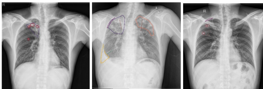
Fig. 1. Markings of abnormal areas by radiologists.

domain dataset is used as a feature extractor for the images in the small, target dataset of interest. For our application, the number of annotated images is also quite small. However, we try to generate a big dataset of small image patches which can be used to train CNN directly. Specifically, we use patches that are extracted based on superpixels. In addition, we use multiscale patches in order to catch/preserve global spatial consistency. Therefore, the TB regions are located by identifying those superpixels whose corresponding patches are classified as abnormal by CNN. Work described in this manuscript is significantly different from [3] with respect to not only the task, but also the method although both approaches apply CNN for TB analysis in CXRs. In the following sections of the paper, we first introduce our dataset and the annotated collection. Then we describe our approach, followed by the presentation and discussion of our experimental tests. Finally, we conclude the paper with the outline of directions for future research.