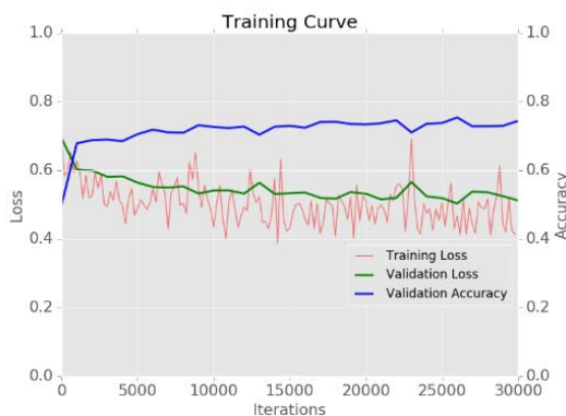
Fig. 3. Classification accuracy on the patch training and validation set.