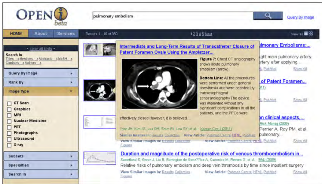
Fig. 1. Textual search results in the list view of the Open system. The navigation panel on the left allows filtering and sorting search results along several facets. The pop-up window that appears on scrolling over the image provides a brief, but key, summary of the information in the article.