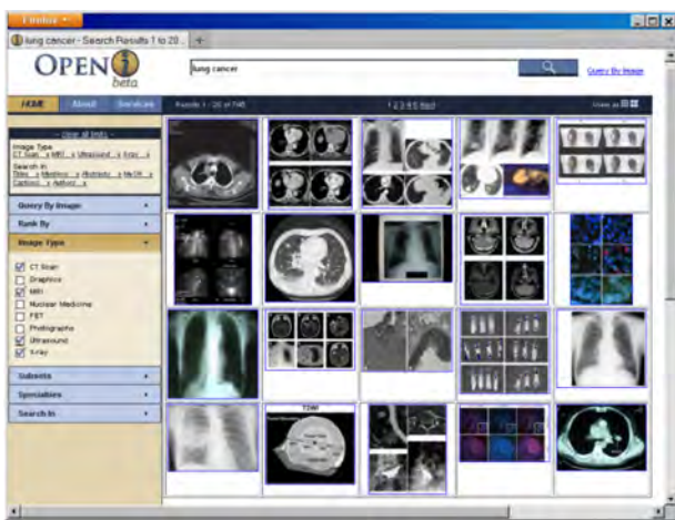
Fig. 4. Search results in a grid display.

Based on the principles developed by [16], the search results are displayed either on a grid that allows a view of all top 20 retrieved images (Fig. 4), or as a traditional list in Fig. 1. In either layout, scrolling over the image brings