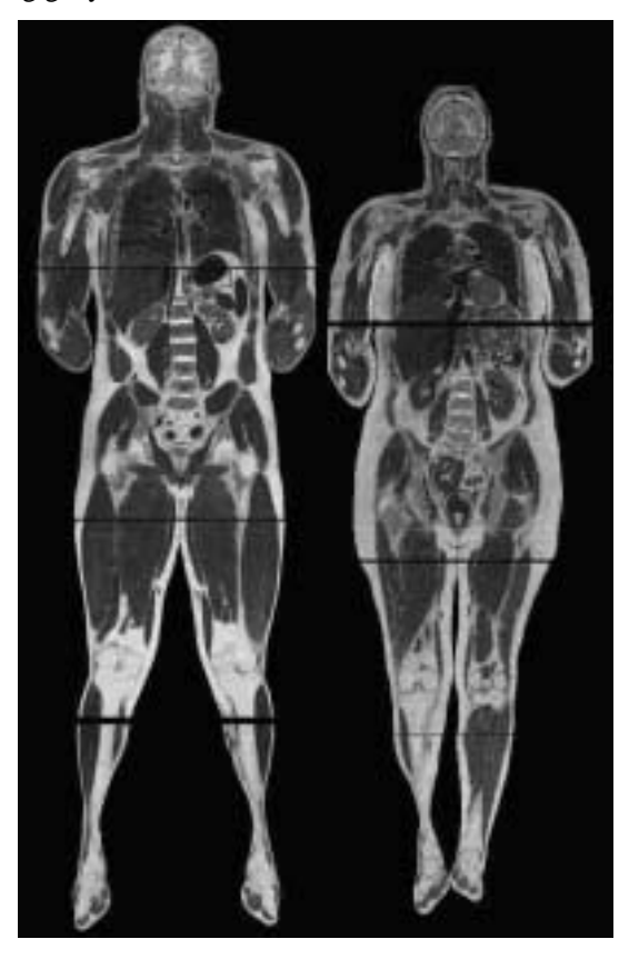
Figure 1 – Visible Human Male and Female

The details of how the images which make up the Visible Human data sets, figure 1, were captured are described elsewhere [2]. The male data set contains 1871 digital axial anatomical images obtained at 1.0 mm intervals and is 15 gigabytes in size. The female data set contains 5189 digital axial anatomical images obtained at 0.33 mm intervals and is 39 gigabytes in size.